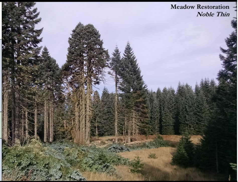
Meadow Restoration Noble Thin

4 miles road improvements .5 miles road decommissioning/fill or culvert removal