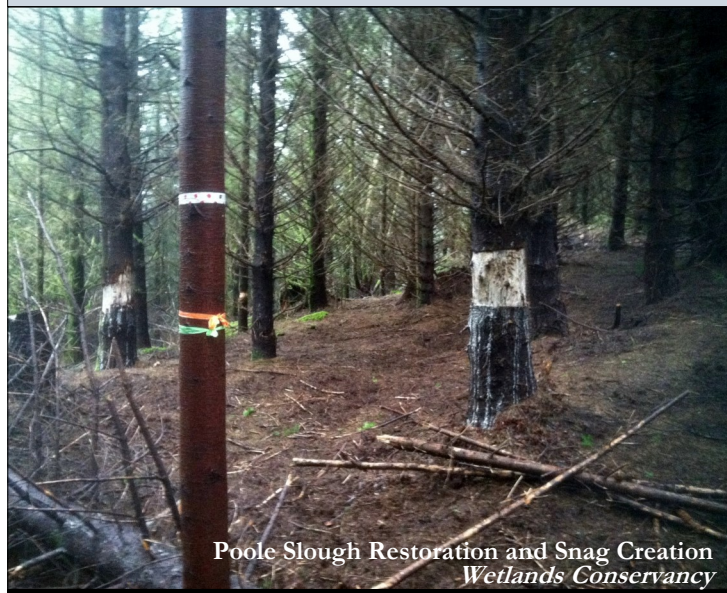
Poole Slough Restoration and Snag Creation Wetlands Conservancy

23 acres along 28 miles riparian area: herbicide 39 acres riparian area: mechanical/manual