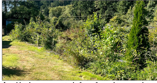
Local landowner property, before, after and two years later Riparian Restoration Planting Program Siuslaw Watershed Council