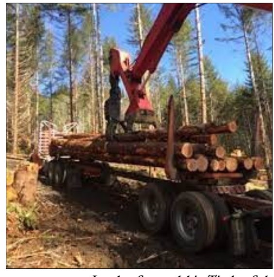
Lyndon Stewardship Timber Sale