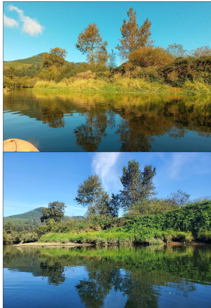
South County Knotweed Phase 3: Before & After Nestucca River, Tillamook SWCD, Sherry Vick