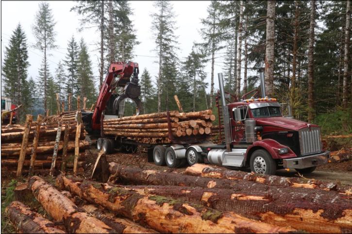
Lyndon Stewardship Timber Sale

239 miles overall road improvements & deferred maintenance