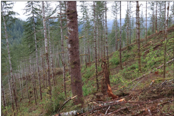
After thinning: Lyndon Stewardship Timber Sale