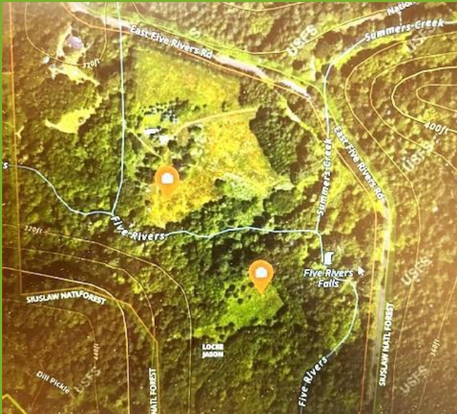
Hansen property location