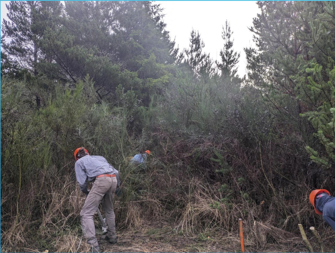
BROOM REMOVAL BEGAN MONDAY